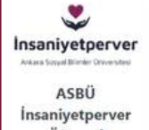
ASBÜ İnsaniyetperver Öğrenci Topluluğu