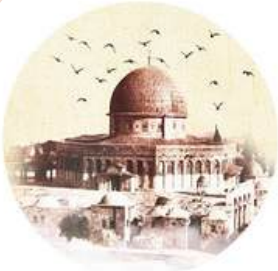
Research Centre For Quds Studies