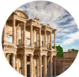
Center For Culture And Civilization Researches