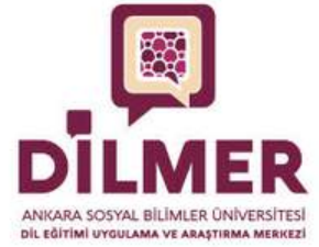
Language Teaching Res. And App. Centre