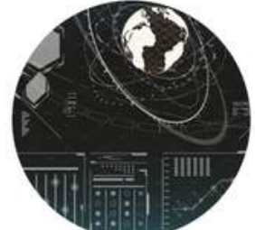
Application And Research Centre For Method Education