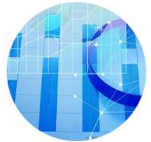
Centre Of Experimental Economics