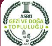
ASBÜ Gezi ve Doğa Öğrenci Topluluğu