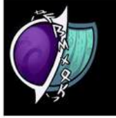
ASBÜ Kurgu Evrenler Öğrenci Topluluğu