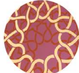
International Center For Islamic Economics And Finance