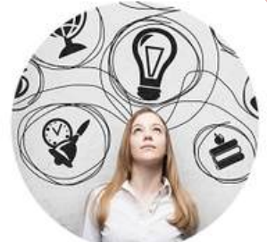
Center For Higher Education Research