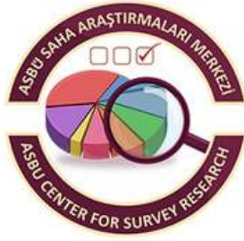
Center For Survey Research