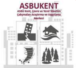
Asbü Kent, Çevre Ve Yerel Yönetim Çalışmaları Arařtırma Ve Uygulama Merkezi

For further details about research centers, you can click here .