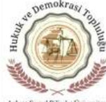
ASBÜ Hukuk ve Demokrasi Gençlik Öğrenci Topluluğu